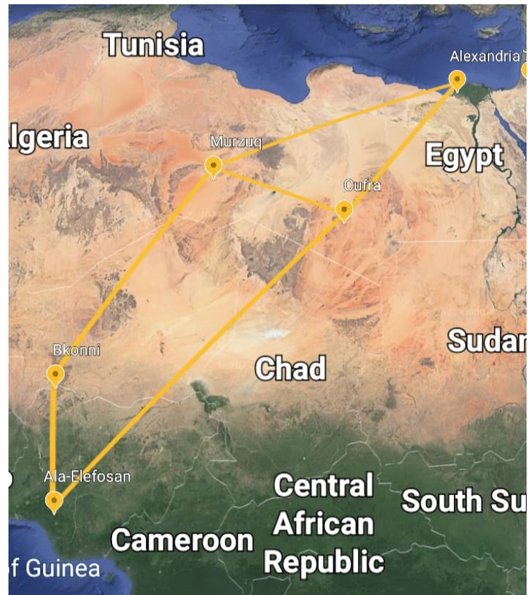
Figure 2. Map.