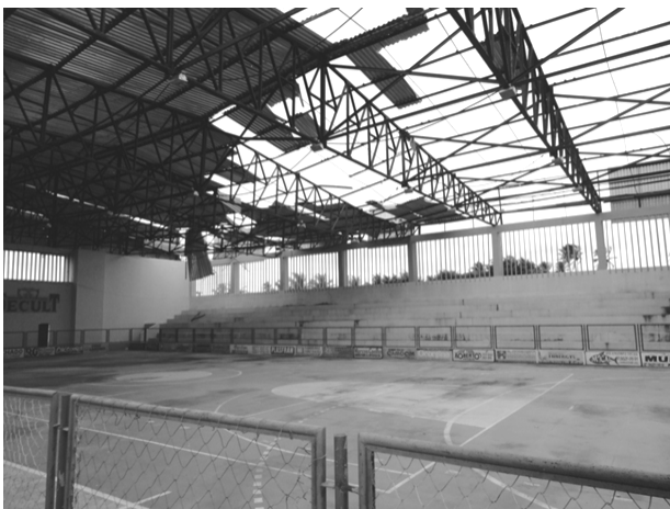
Figure 2: Conservation Status of Municipal Gymnasium

education (PE) classes. Heterogeneity was also found in the distribution of social support units. It is worth noting that observational research established that the few public spaces which existed for motor practice were in a state of total abandonment as illustrated in Figure 2.